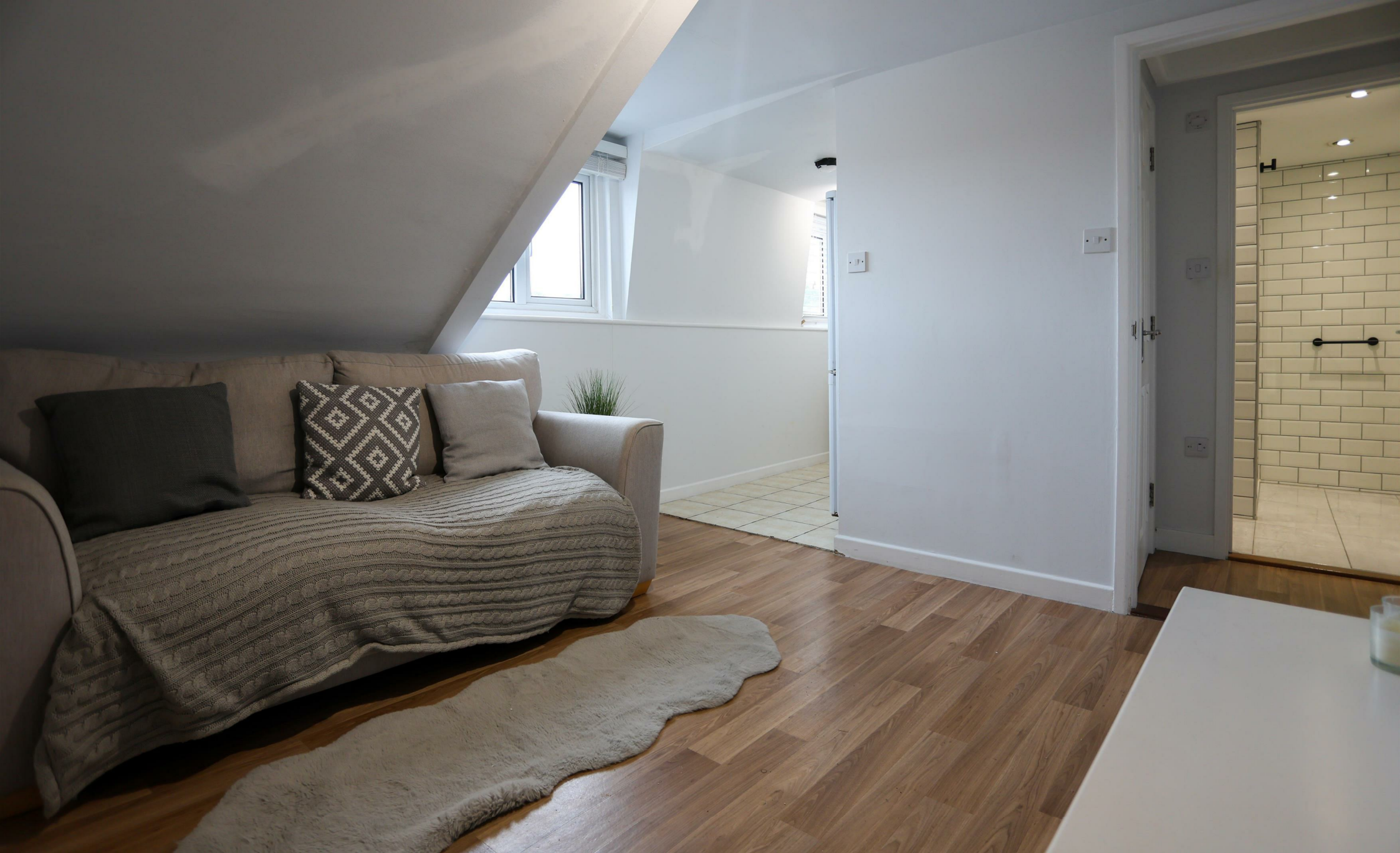
Top Flat, 4 Roseville Terrace Roseville Street, St Helier, Jersey, JE2 4PL £220,000